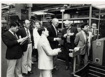
Fabrikbesuch bei Brueninghaus und Dissauer